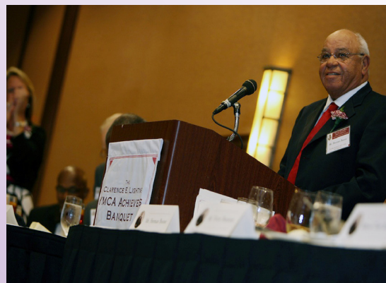
Brother Coach Herman Boone

The Omega Life Membership Foundation was a financial supporter of The Lightner banquet.